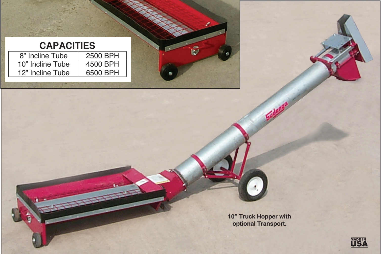
10" Truck Hopper with optional Transport.