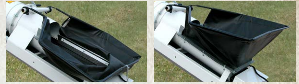
OPTIONAL SPRING LOADED HOPPER